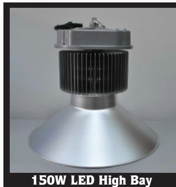
150W LED High Bay

Every fixture in the Bright Idea LED High Bay Series uses an eye-hook for quick and easy installation. Steel safety wire is included for added security. Installation by a licensed electrician is recommended.